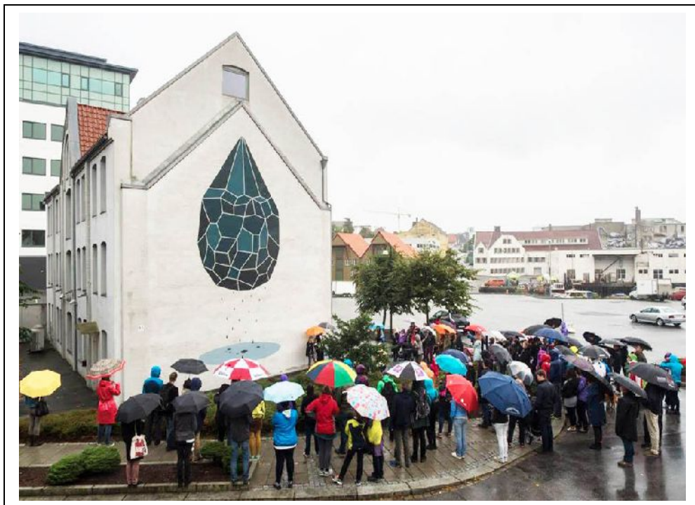
Andreco, Floating Rock Dripping Oil, at NUART FESTIVAL 2014, Photo by J. Rodger, at Stavanger - Norway

| 25 October - 13 December 2014 | Opening Saturday 25 OCTOBER 2014 time 18:30 – 20:30