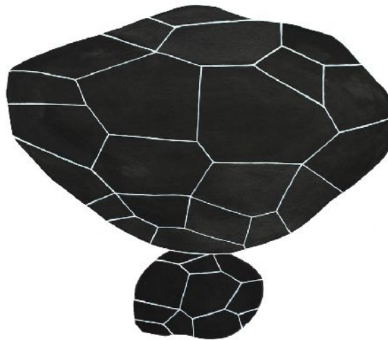
Andreco, Balance 1, Acrylic on Paper, 2014, Courtesy Traffic Gallery

There isn't just a method (I don't follow a specific scheme for my work ) but the artwork production process is mostly site specific and influenced by the contest, the people that I meet and the environment. The artwork can be related to searching materials and natural elements, observing transformations and simplifying ideas in shapes. Some times I'm looking for a delicate balance, others times for a heavy impact. A common operation in my work is to transpose natural elements from the landscape to the built environment, changing the point of view, the perception and the conventional meaning of the objects, with the clear statement: "Nature as Art" .